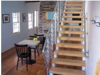
Part of the sitting area at Hope and Union.

Take everything you know about coffee shops and throw it out the window. No part of this Charleston coffee shop resembles that of your typical establishment. Visitors have to walk a few blocks from Charleston's Historic District to find Hope and Union. Simply look for the coffee sign that hangs from the house, because if you're looking for what looks like a coffee shop, you'll never find it. Hope and Union blends in with the rest of the street, as it's just a multi-story restored home. I walked up, stopped for a moment and muttered: "This is it?". I honestly expected to walk up the ramp and through the doors and there just be no air conditioning. Yet this was only one of the many surprises.